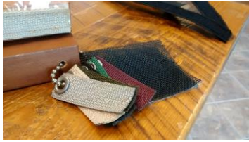
Velcro colors: White,Grey, Beige, Green, Brown, Burgundy, Black