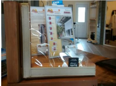
PVC Panel recessed mount