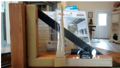
Dual panel –recessed mount

Please specify panel requirement: PVC only, PVC/Screen dual system or Screen only.